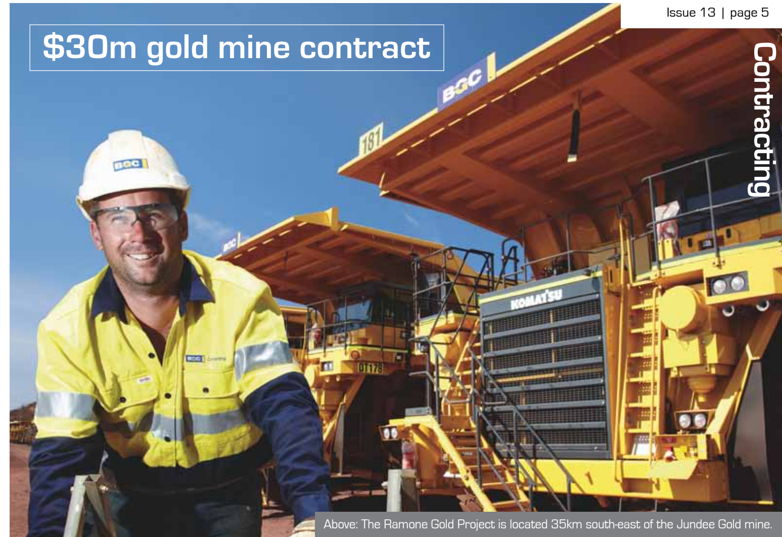
Above: The Ramone Gold Project is located 35km south-east of the Jundee Gold mine.