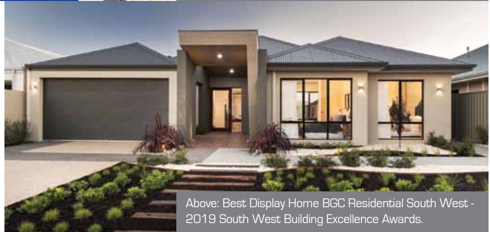
Above: Best Display Home BGC Residential South West - 2019 South West Building Excellence Awards.

Now Living took home a further two awards from the Housing Excellence awards, taking out the Best Contract Home (Under $200,000) and Best