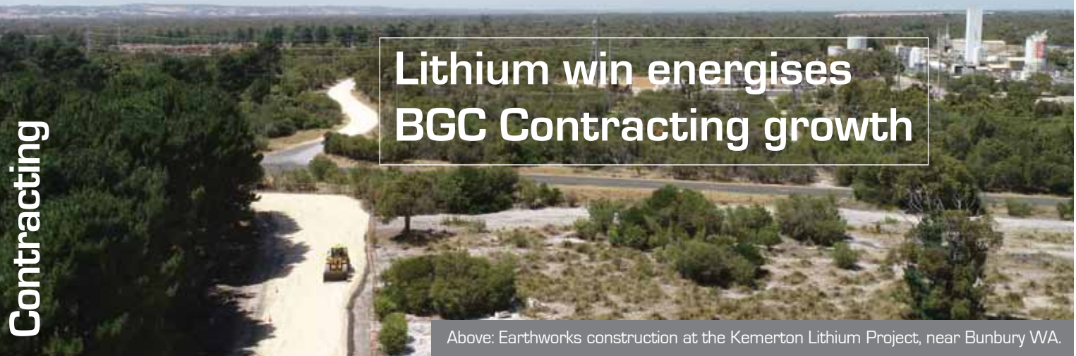
Above: Earthworks construction at the Kemerton Lithium Project, near Bunbury WA.

BGC Contracting has commenced an earthworks construction contract at the Albemarle Group's Kemerton Lithium Project, located near Bunbury in Western Australia.