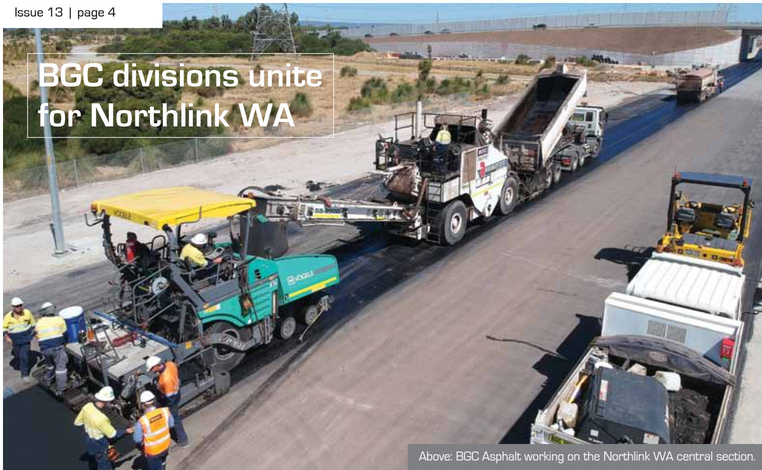
Above: BGC Asphalt working on the Northlink WA central section.