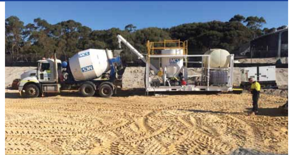
Above: Construction work has commenced on the eco-resort at Pinky's, Rottnest Island.