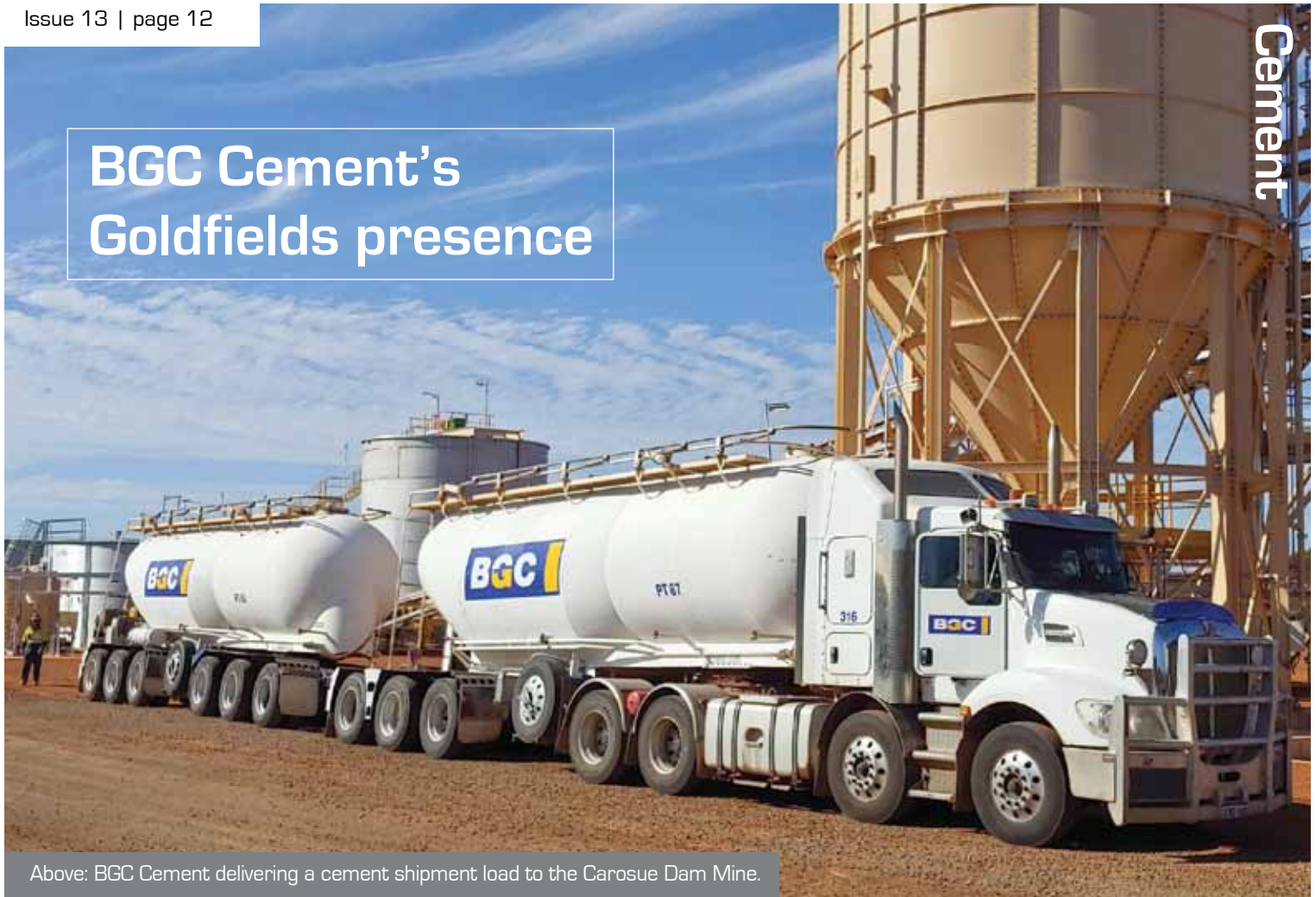
Above: BGC Cement delivering a cement shipment load to the Carosue Dam Mine.