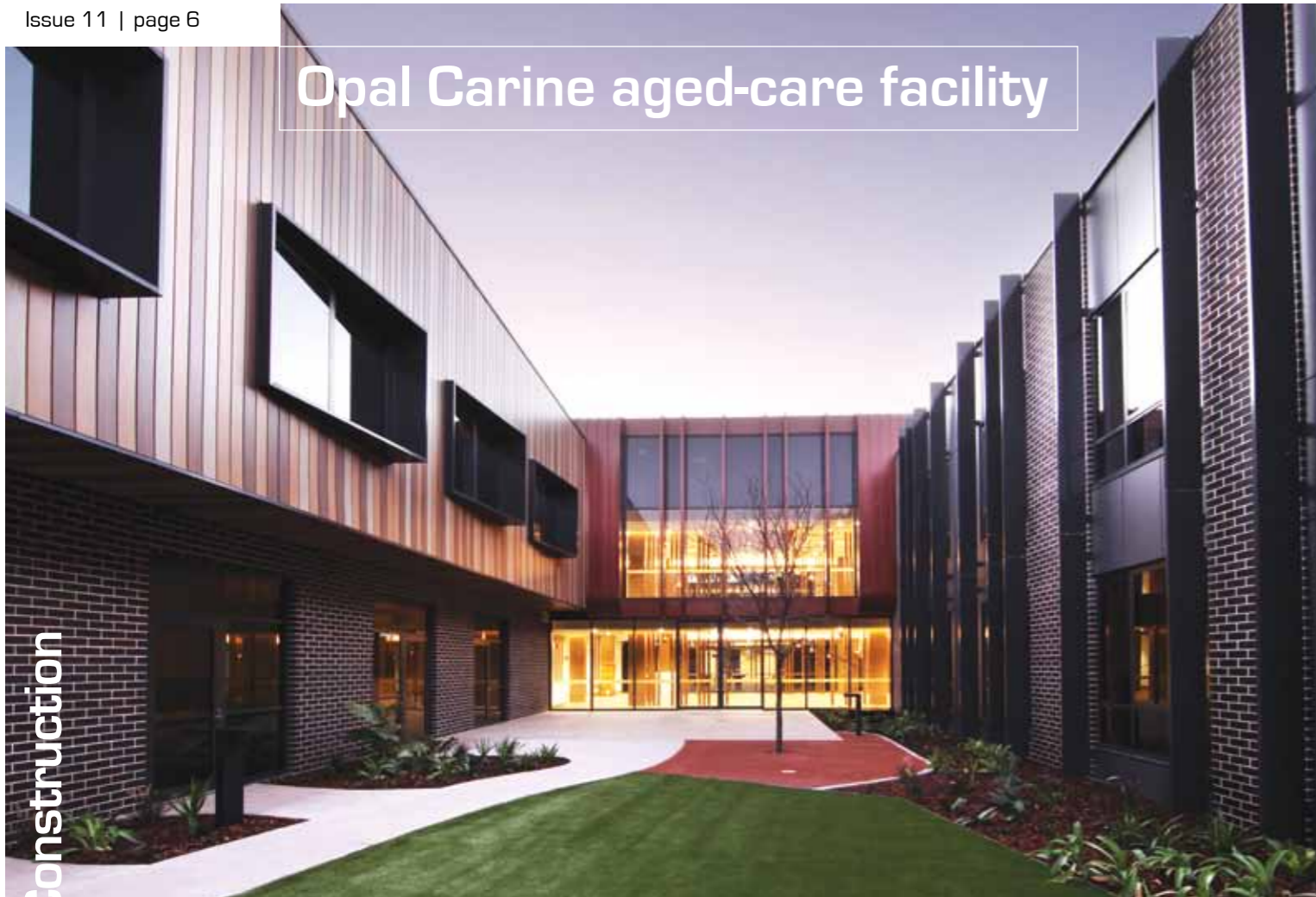
Above: The new 145-bed residential aged-care facility located in Carine.